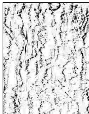
Bark Rubbing Samples